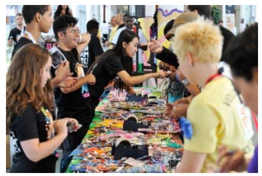
At the Condomize table in the main hall of the Reed Messe Wien.