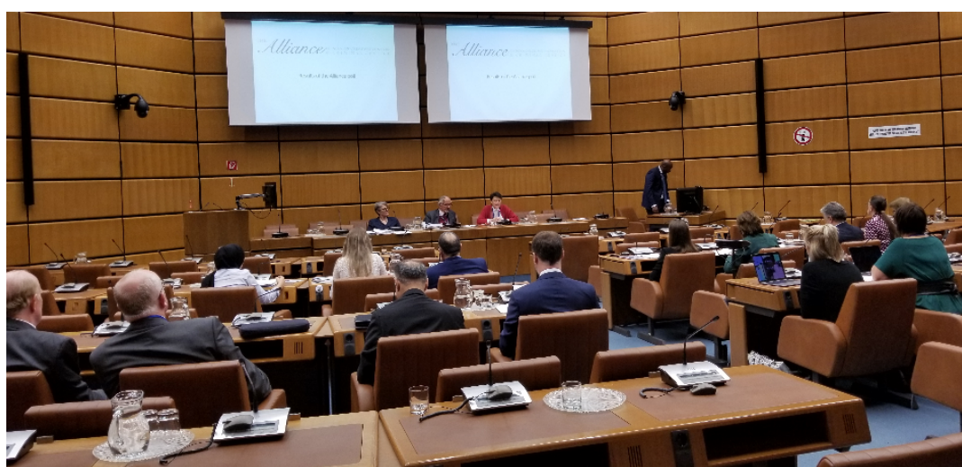
During the meeting