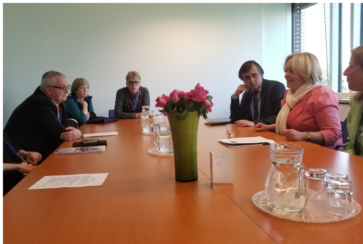
Photo at the meeting of the Alliance