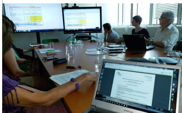
Open forum discussion of Income & Expenses Details

“There is much work to be done to confront the many harms inflicted by drugs to health, development, peace and security, in all regions of the world,” ----- by Mr. Fedotov.