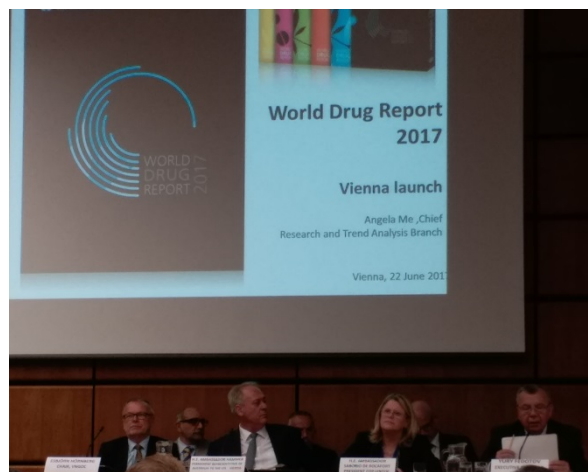
Launch of the World Drug Report