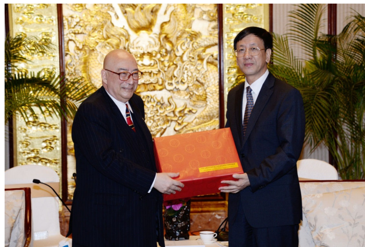
向澳門亞太家庭組織贈予紀念品 Presentation of gifts to OFAP

OFAP will take good advantage from the private contents of the meeting.