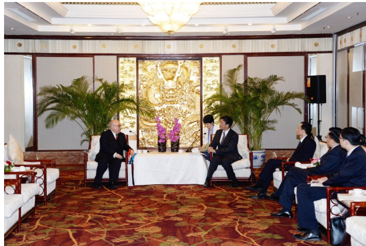
會面現場 The Official Audience